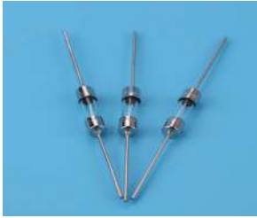
Dimensions (units: mm)